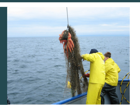
The Community-based Marine Debris Removal annual grant competition officially begins. 12 projects are funded.

The MDP begins funding the Northwest Straits Initiative to remove legacy fishing nets from the Puget Sound, WA.