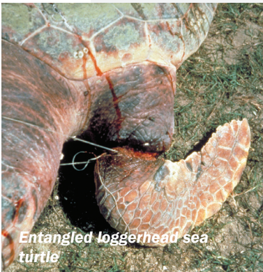
Entangled loggerhead sea turtle

Sea turtles are air-breathing reptiles that are well adapted to life in the marine environment. They inhabit tropical and subtropical ocean waters throughout the world. Of the seven species