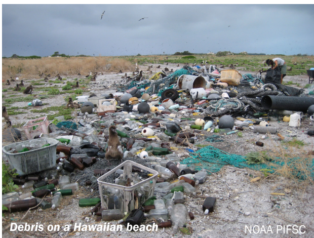
Debris on a Hawaiian beach

Marine debris also can endanger people's health and safety. Sharp objects, such as broken glass and rusty metal, may cause injuries when people step on them on the beach or ocean floor. Abandoned fishing nets and lines can entangle scuba divers, with some divers barely escaping serious injury or death. Contaminated debris, including medical waste may pose a public health hazard through disease transmission.