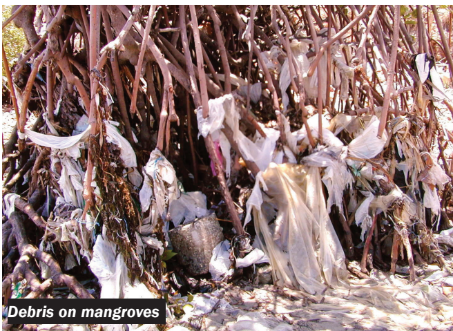
Debris on mangroves

Lost or discarded fishing gear can financially harm a region's industries in several ways. In addition to the costs associated with replacing the missing gear, marine debris can cause costly or irreparable damage to boats. Fishing nets can wrap around propellers, plastic sheeting and bags can clog cooling water intakes and lost nets