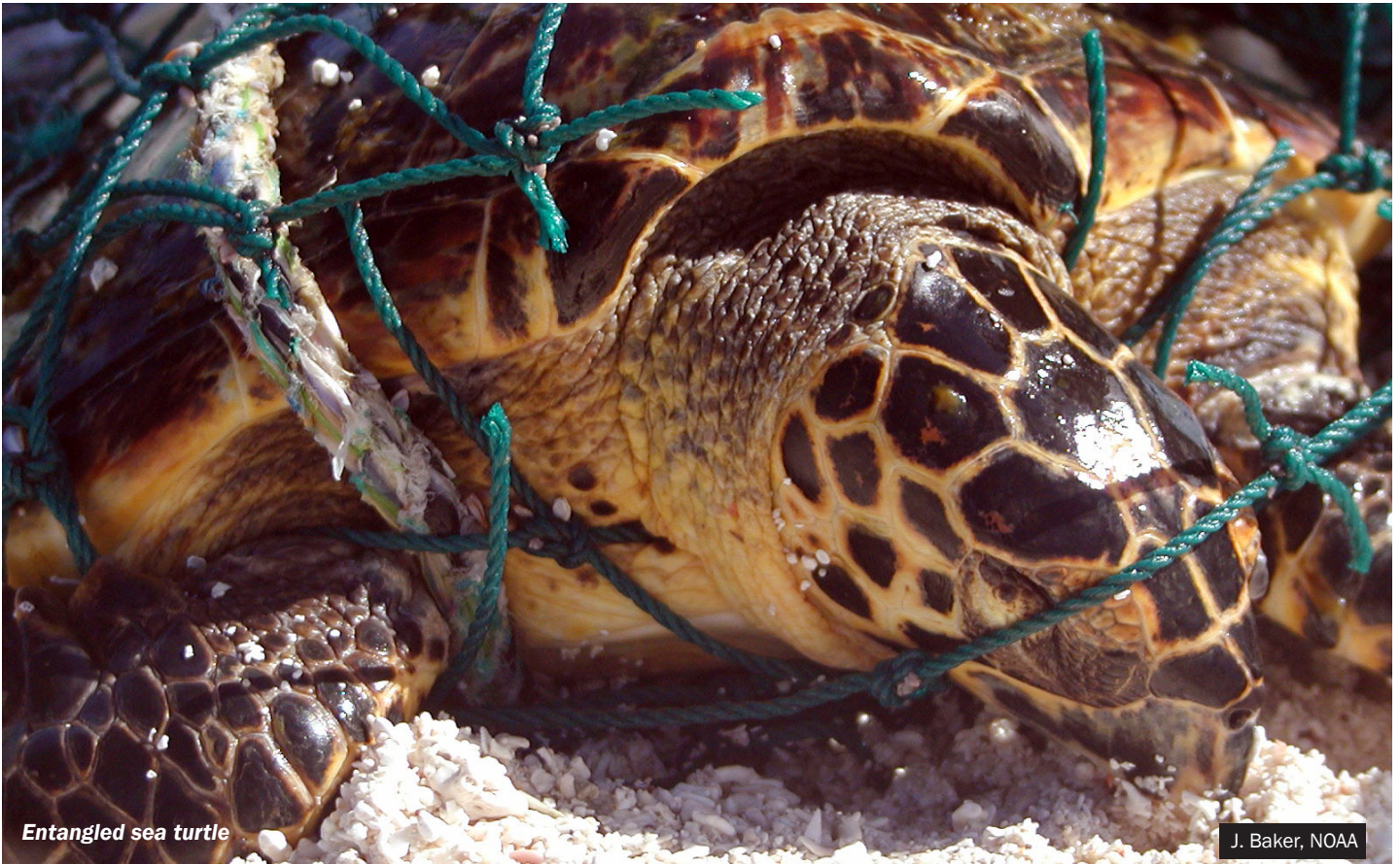
Entangled sea turtle