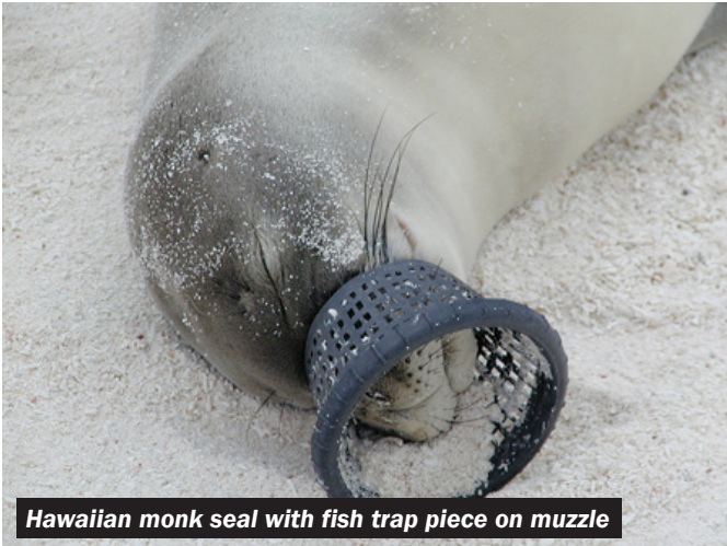
Hawaiian monk seal with fish trap piece on muzzle