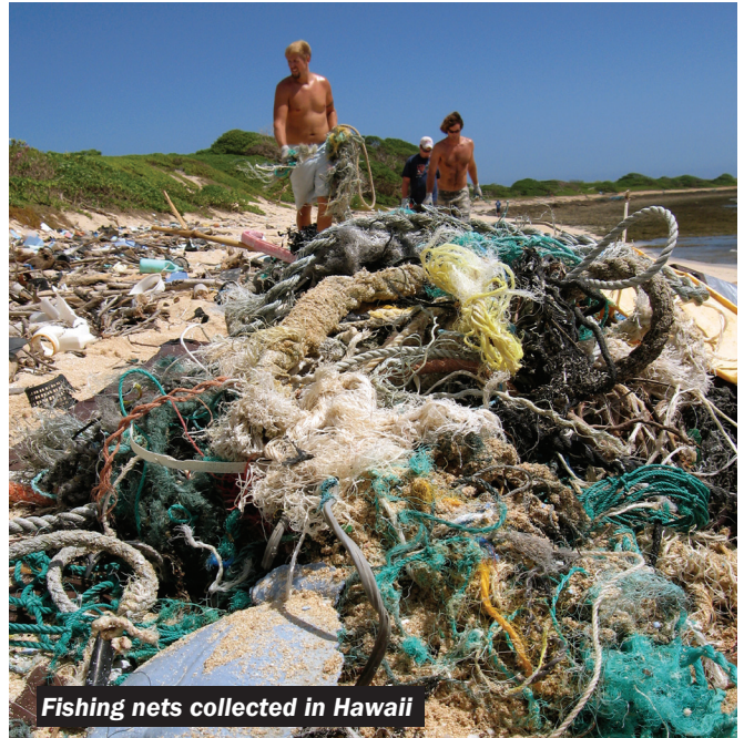
Fishing nets collected in Hawaii

Lost traps also continue to attract fish and crustaceans, which enter them in search of food or shelter. In New England alone, it is estimated that nearly one-half million lobster pots are lost every year. 6 Over 900 derelict crab pots were observed during five days of sonar surveying in the northern Puget Sound, Washington, and studies show that derelict crab pots have a detrimental effect on the Chesapeake Bay – they continue to catch blue crabs and other important living bay resources without ever being retrieved. 7