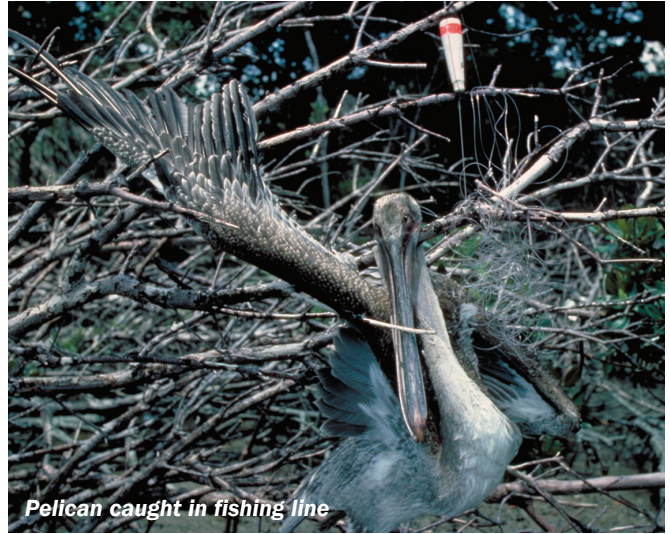
Pelican caught in fishing line

As mentioned earlier, many marine animals ingest small pieces of marine debris (primarily made of plastic) that can accumulate in their bodies. Zooplankton and other small organisms have been found to ingest micro-particles of plastic. According to a report by the US Environmental Protection Agency, when animals higher on the food chain eat those small organisms, they also ingest the debris those organisms have eaten. The debris accumulates in their bodies. 8 The higher an animal is on the food chain, the greater the quantity of the debris that is consumed and accumulated. For example, eagles and other predators high on the food chain have been found with large concentrations of plastic pellets in their stomachs after preying on smaller birds, which ingested the pellets in fish they consumed. This accumulation is called bioaccumulation . Biomagnification refers to the tendency of pollutants to concentrate as they move from one feeding level (also called trophic level) to the next.